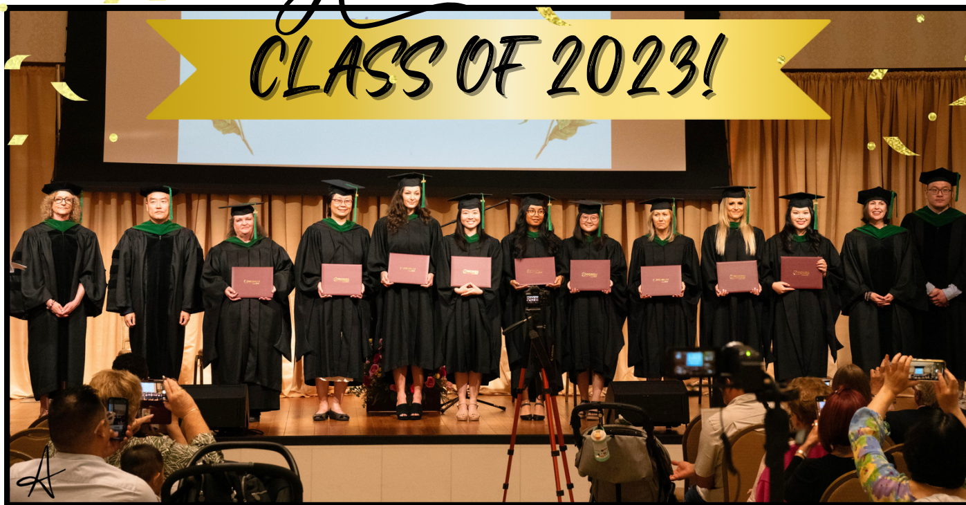
Group photo of the 2023 graduates.