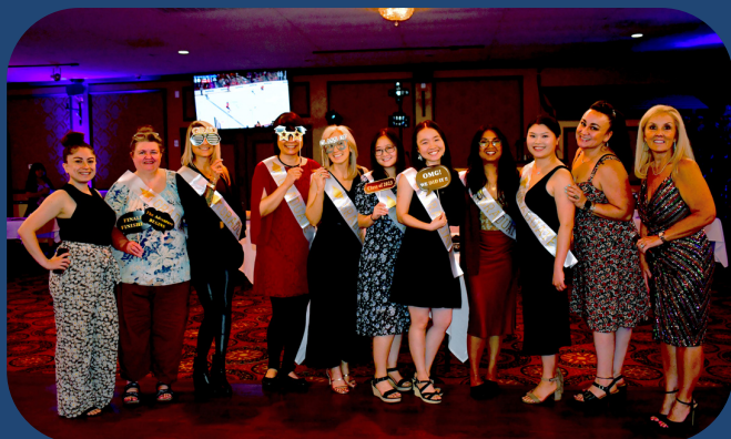
Group photo of graduates and WSA officers.