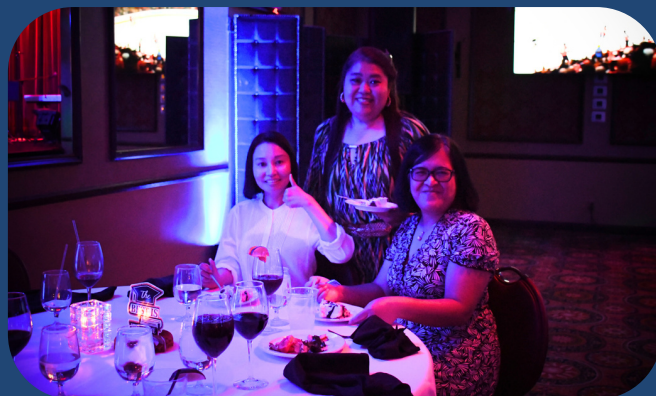
Wongu staff and students join the fun!