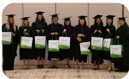
Graduates pose with donations from sponsor, KPC.