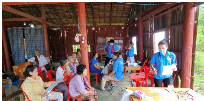
The bustling clinic at Koh Chheng.