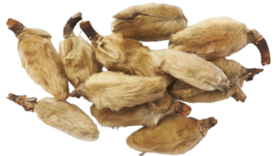
The Magnolia flower bud that is used as an herb.

Xin Yi Hua is a large and fuzzy magnolia flower bud. In Oriental Medicine, it has been used as medicine, as a tea. It has a spicy taste and has a warm property. Magnolia flower bud bears the winter, cold weather, and wind. As a result, this herb is good to stop colds and warm our bodies. Xin Yi Hua can effectively open the orifices which can be helpful to open the nasal passages. It is used for allergies, chronic sinusitis, headache, cough, and any other sinus issues. Xin Yi Hua is commonly used for cold symptoms, reduces blood pressure, is anti-inflammatory, anti-bacterial, and helps with sinus issues.