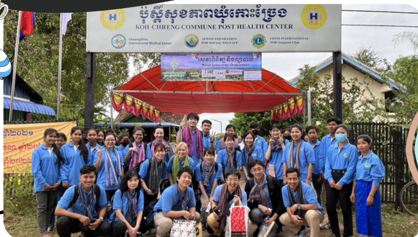
Group photo of the participants of the Medical Missionary trip in Cambodia