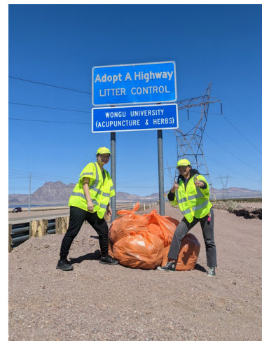
WSA Members standing in front of their haul.